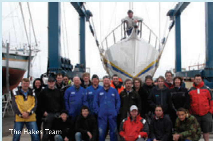
The Hakes Team