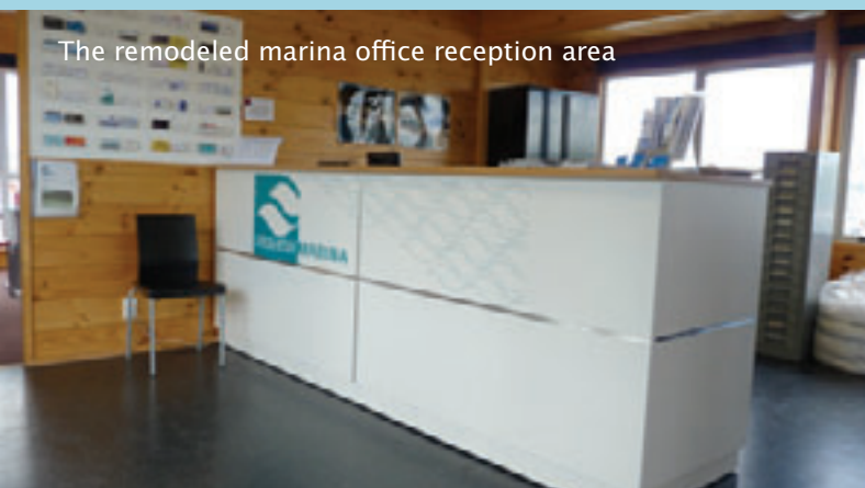
The remodeled marina office reception area

Customers wanting to use the computer are welcome to do so – there is no charge for this service. In addition to the computer the Sea Centre lunchroom (pictured) also has a coffee machine, filtered water, sink, microwave and toaster for the use of marina customers. A first aid kit is located above the sink.