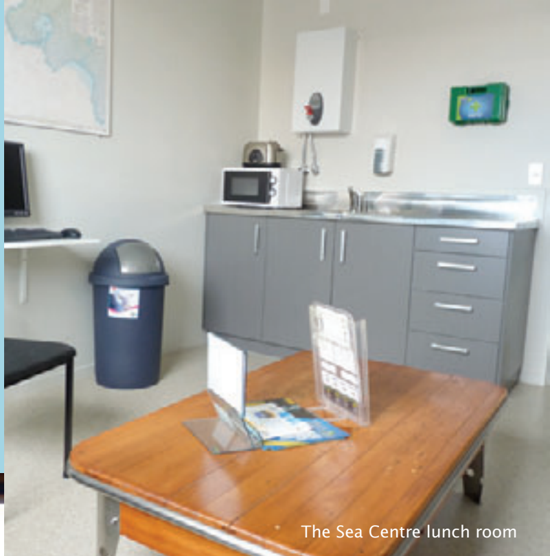
The Sea Centre lunch room