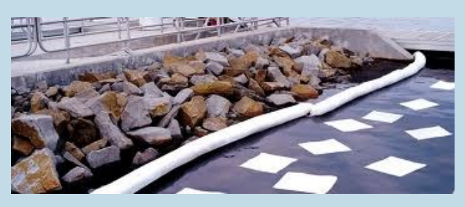
Absorbent pads and booms from a spill kit shown here in use containing and collecting a marina spill

For a spill in the harbor please contact either Wellington Harbour Radio (Beacon Hill) on VHF Ch14 or ph: 04 473 4547, or the Greater Wellington Regional Council's Environment Hotline, 0800 496 734 without delay. Prompt action may mitigate the effects of the spill and avoid unnecessary delays in tracing the source.