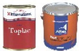
PAINT & MAINTENANCE

100 Port Road, Seaview Marina P: 04 586 6955 Monday to Friday 8:30am to 5:30pm Saturday and Sunday 8:30am to 5:00pm