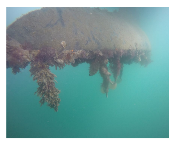
The bottom of the keel bulb of this yacht wasn't cleaned properly before departing from Auckland. Several fanworms and other marine pests were allowed to grow as a consequence.