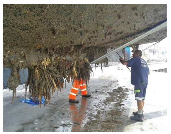
Don't let your boat look like this!

Please try to take photos and record some details, like the name of the vessel and where it was moored, or the location if it was found on the sea floor or on structures.