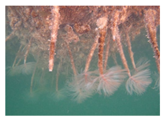
This is what Mediterranean fanworm looks like when underwater. The worm lives inside a tube and extends its feeding fan out the top end of the tube.